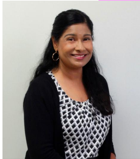
Principal Investigator Trinidad and Tobago