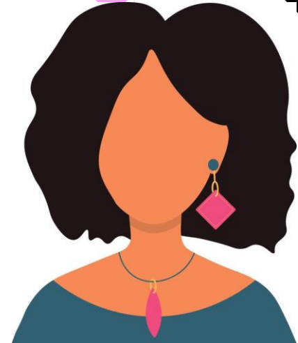
Lived Researcher Jamaica