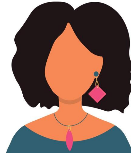
Lived Researcher Trinidad and Tobago