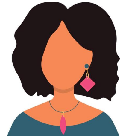
Lived Researcher Barbados