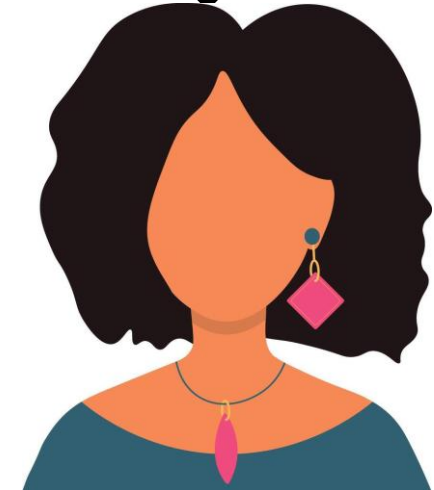
Lived Researcher St. Lucia