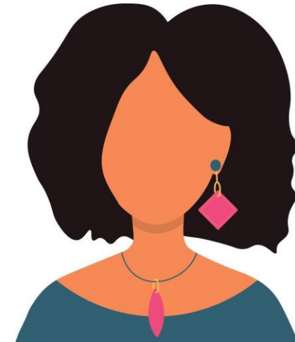
Lived Researcher Grenada